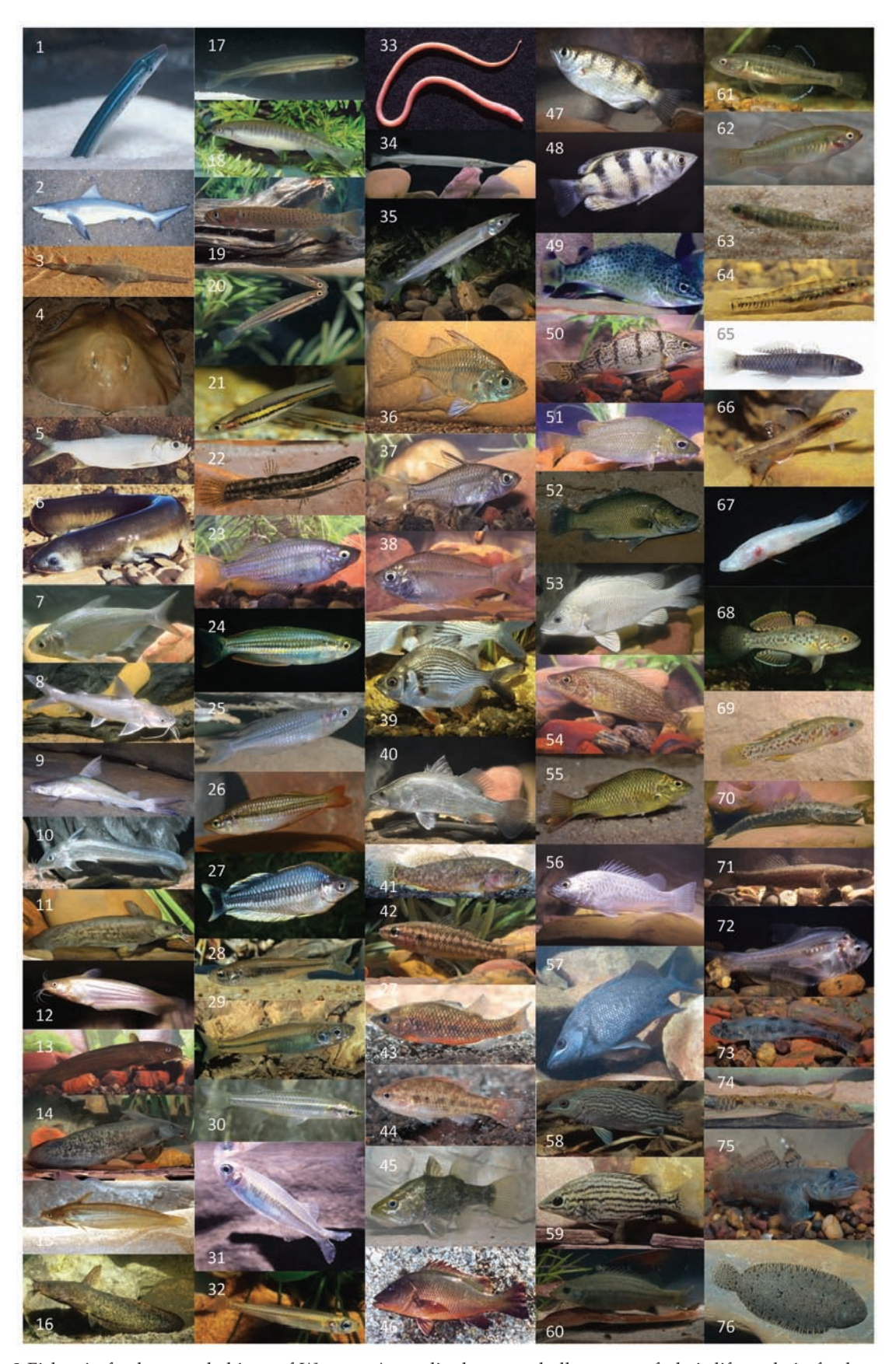
Figure 2 Fishes in fresh water habitats of Western Australia that spend all, or part of, their life-cycle in fresh water. Not pictured are the marine migrants, marine vagrants, estuarine vagrants, undescribed species, Milyeringa justitia or Kimerleyeleotris notata . Please refer to Table 1 for species names.