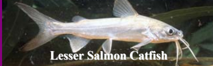
Lesser Salmon Catfish