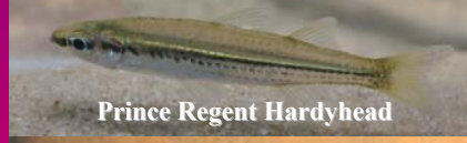
Prince Regent Hardyhead